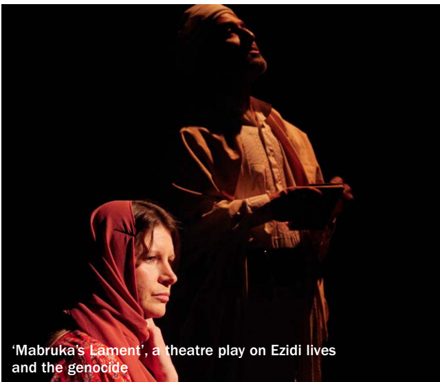
'Mabruka's Lament', a theatre play on Ezidi lives and the genocide