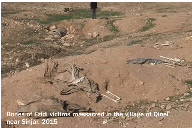
Bones of Ezi victims massacréd in the village of Qinei near Sinjar. 2015