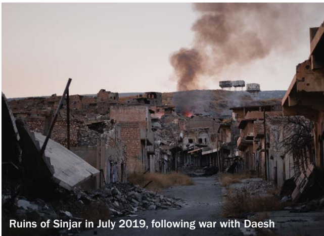
Ruins of Sinjar in July 2019, following war with Daesh