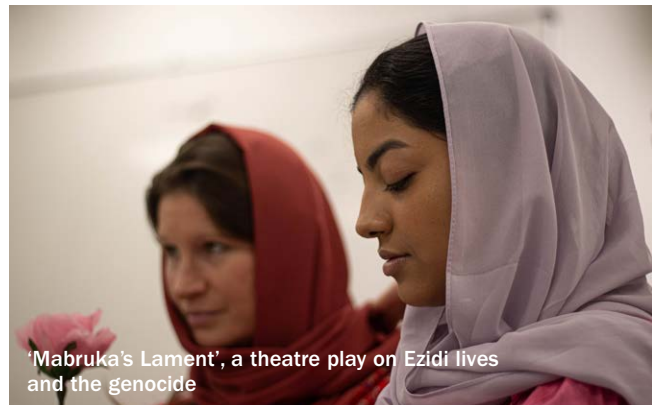
'Mabruka's Lament', a theatre play on Ezidi lives and the genocide