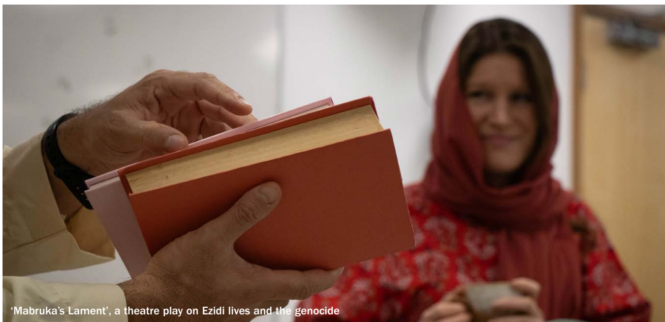
'Mabruka's Lament', a theatre play on Ezidi lives and the genocide

Many Ezidi people now reside in internally displaced persons (IDP) camps in the Iraq and Kurdistan regions. Other Ezidi people are overseas with about 200,000 people living in Germany, about 50,000 in other European countries including the UK, around 12,000 in USA and Canada, and approximately 3,000 in Australia.